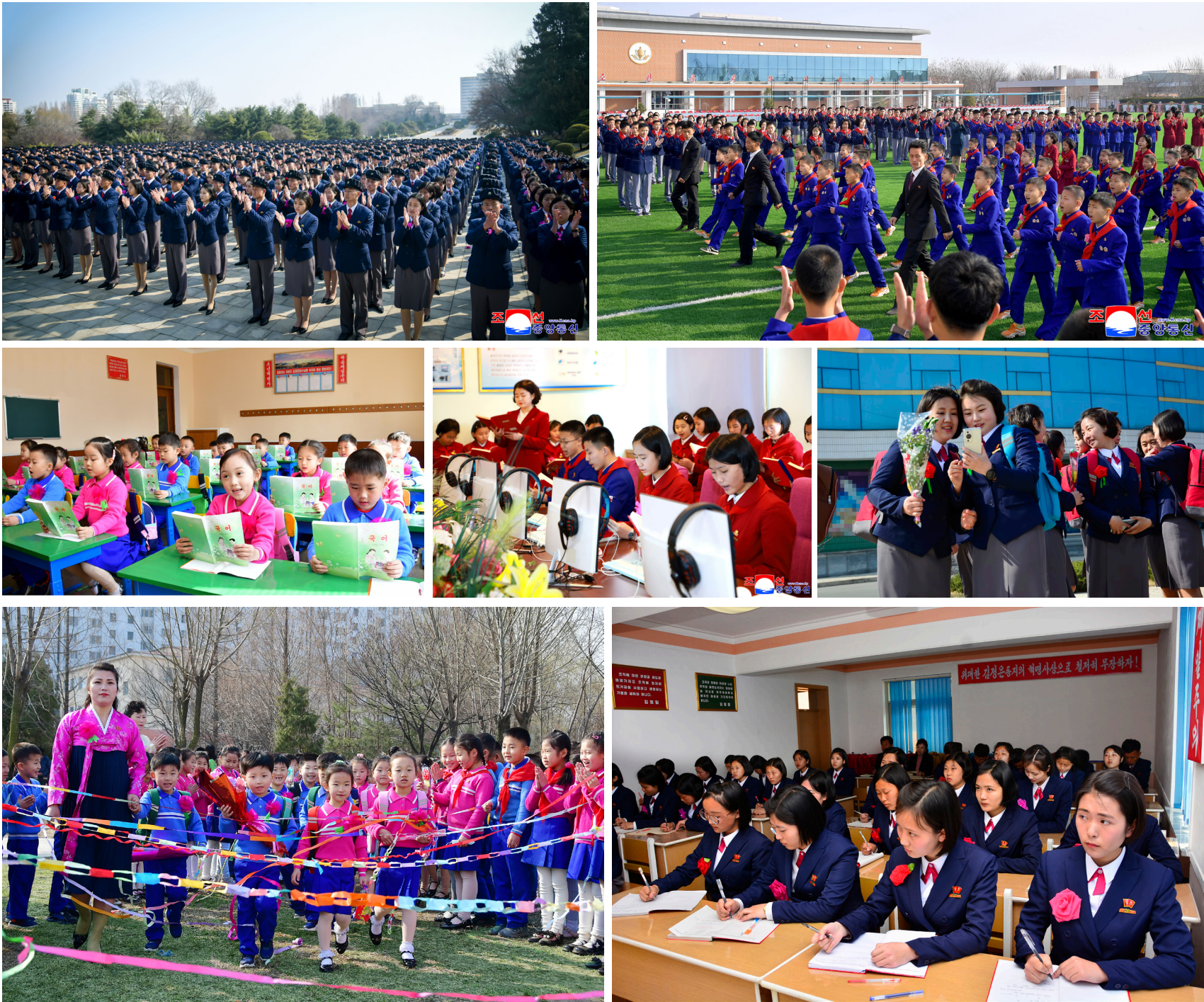
School-opening ceremonies are held at educational institutions across the country on April 1 to mark the new school year for 2025.

School-opening ceremonies took place at educational institutions across the DPRK on April 1 to mark the new school year for 2025. Ceremonies were held at universities and colleges and all other schools across the country to start the new school year. Kim Il Sung University, Phyongsong University of Education, Changdok School, Amnokgang Middle School No. 1, Sampho Senior Middle School in Kim Hyong Jik County and all other schools were wrapped in a festive mood. Hadan Senior Middle School No. 1 in Sinuiju City, Kwangmyong Senior Middle School in Songgan County and other schools wonderfully built in the areas hit by flood last year were crowded with many parents who gathered together with their children full of joy. Prior to the opening ceremonies, there took place national flag-hoisting ceremonies. Officials of the Workers' Party and power organs and relevant institutions, teaching staff, students and schoolchildren presented bouquets to the new pupils and students entering the campuses and congratulated them. Speeches were made at the opening ceremonies. The first lessons for the new school year began after the ceremonies.