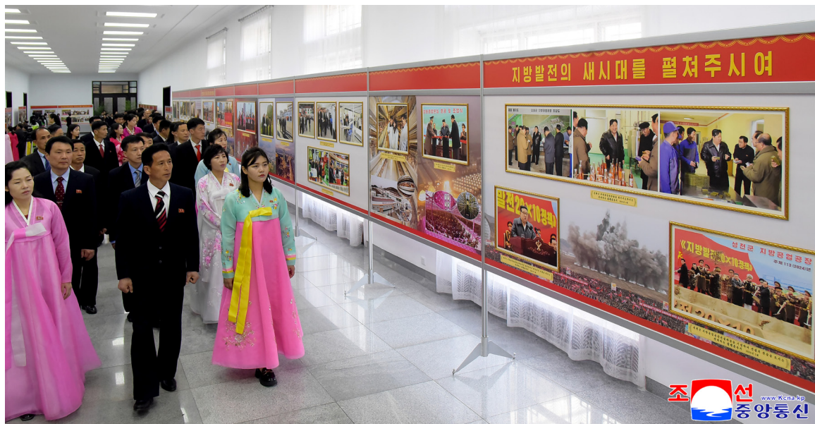
Visitors look round the photo exhibition which opened at the People's Palace of Culture in Pyongyang on April 3.