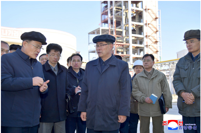
Premier Pak Thae Song (fifth from right) inspects the construction project for establishing the C1 chemical industry.

Presidium of the Political Bureau of the Central Committee of the Workers' Party of Korea, inspected