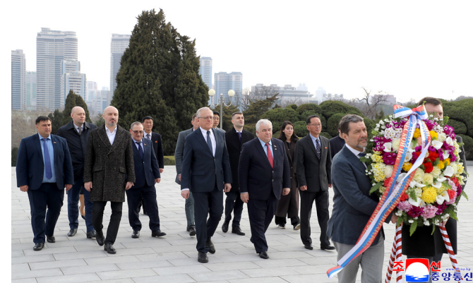
The delegation of the Communist Party of the Russian Federation lays a wreath at the Liberation Tower in Pyongyang on March 31.

A wreath in the name of the Central Committee of the Communist Party of