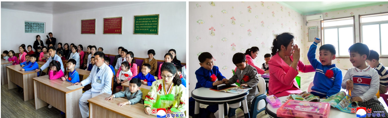
A ceremony takes place to start the new school year at the Korean Rehabilitation Centre for Children with Disabilities on April 1.

Korean Federation for the Protection of the Disabled, officials of the rehabilitation centre and parents of disabled children looked round the physiotherapy, occupational therapy and other service rooms to see the rehabilitation treatment and nursing and upbringing activities of children with disabilities.