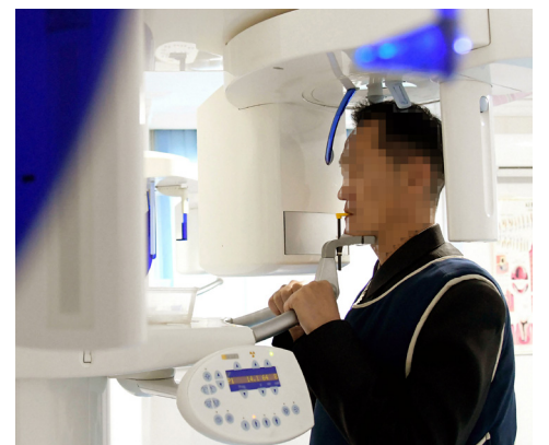
Medical workers widely apply advanced treatment techniques and methods at the Ryugyong Dental Hospital.