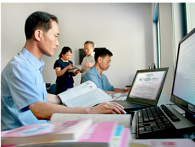
Lecturers are engrossed in writing books at Pyongyang Continuous Medical Education College.

The college is planning to write textbooks and reference and other books of further subdivided kinds in order to contribute to raising the level of specialization of health workers in line with the global trend of development.