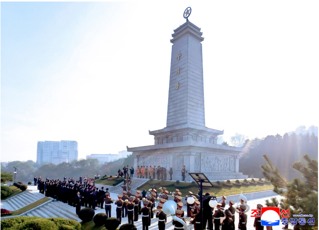
Flower baskets are laid before the Friendship Tower in Pyongyang on October 25.

Earlier, the Chinese consul general in Chongjin hosted a reception.