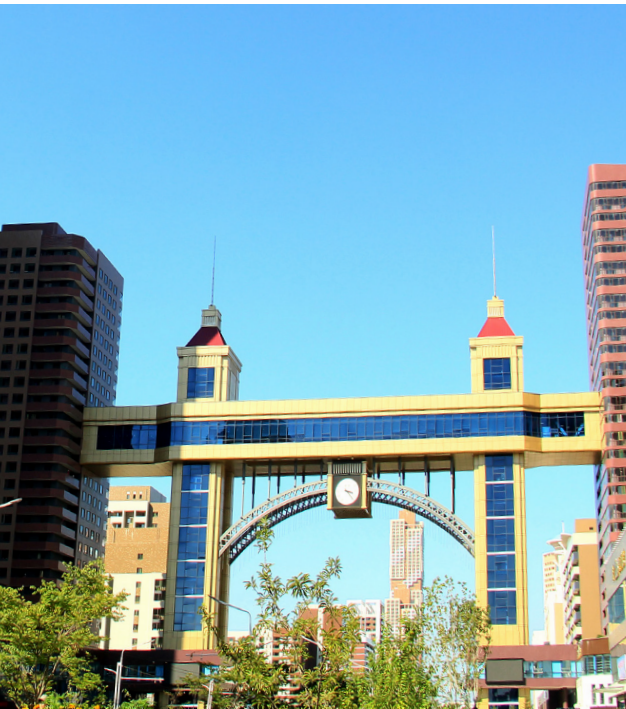
An overhead bridge-style service facility in the section of 10 000 flats at the third stage of the Hwasong area.