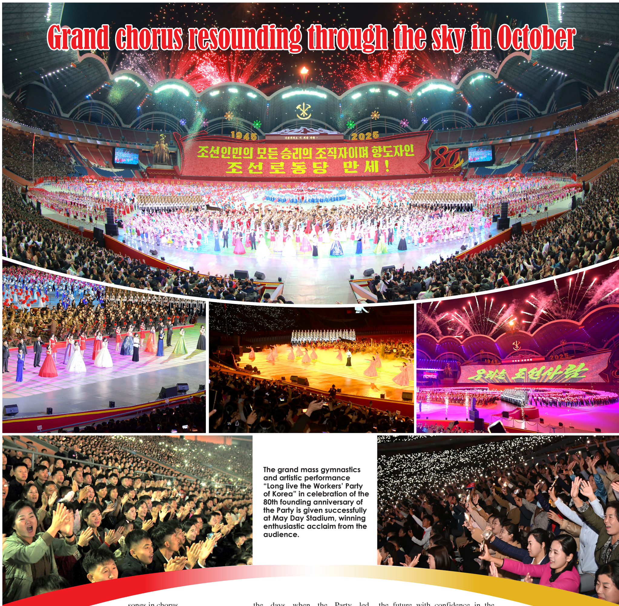
The grand mass gymnastics and artistic performance "Long live the Workers' Party of Korea" in celebration of the 80th founding anniversary of the Party is given successfully at May Day Stadium, winning enthusiastic acclaim from the audience.