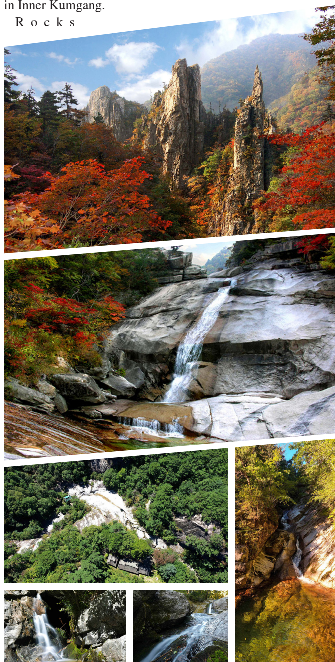
Mt Kumgang is known as a world-famous mountain for its breathtaking natural sights of granite peaks, valleys, waterfalls, pools and seashore.

As Mt Kumgang, called a mountain of diamond which had risen from the sea, preserves the most spectacular natural beauties, it was widely known to other far-away countries from antiquity and even a famous phrase “Don’t comment on the natural scenery of the world before seeing Mt Kumgang” was coined.