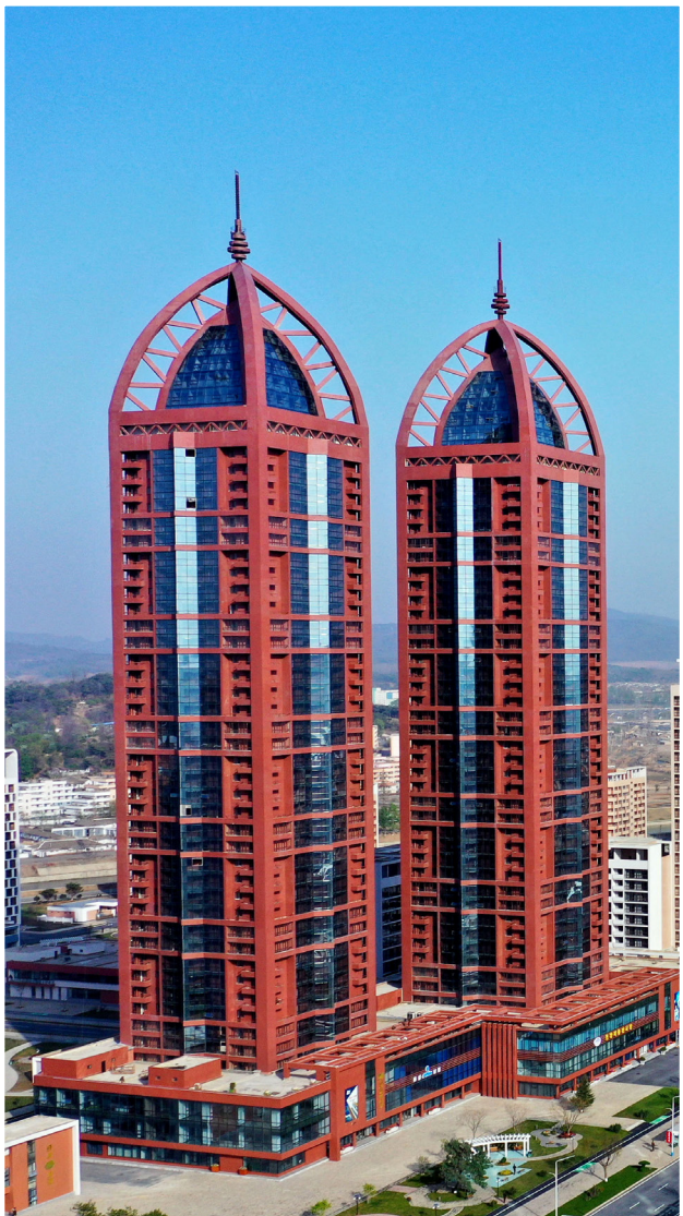
Twin-tower buildings on Hwasong Street.