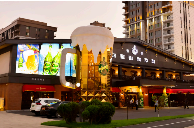
Hwasong Taedonggang Beer House on Rimhung Street.