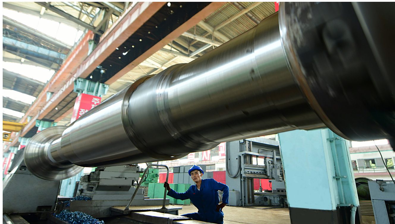
The Taean Heavy Machine Complex steps up the production of custom-built equipment.

These resulted in the strict observance of technical regulations in the whole process of production, leading to an unprecedented innovation in the manufacture of custom-built equipment.