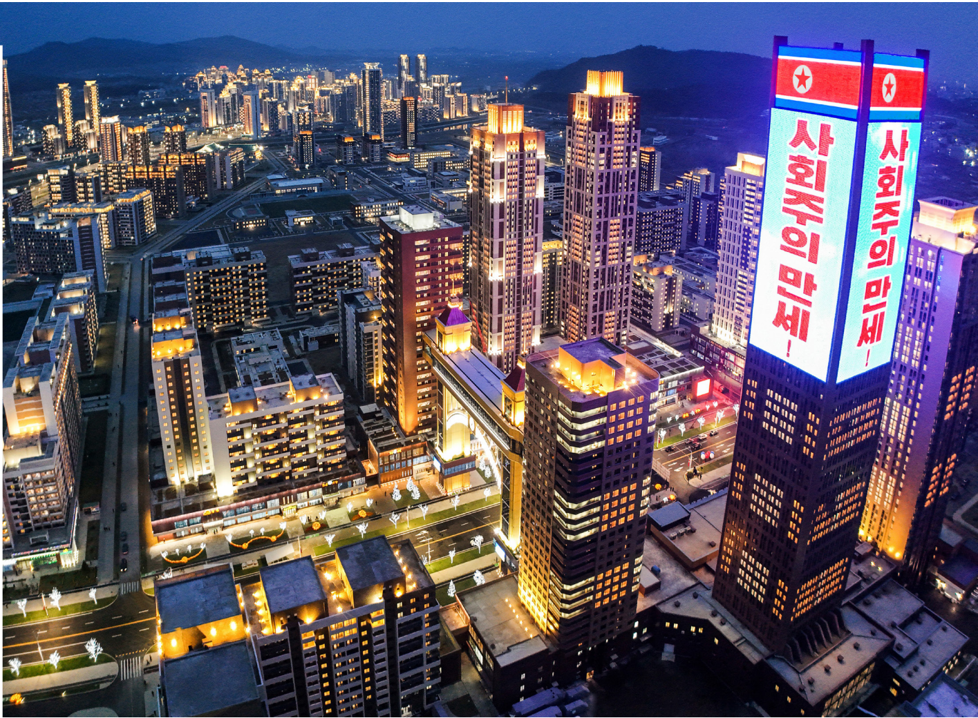
The Hwasong area boasts skyscrapers, high-rise apartment blocks and various service facilities built in good harmony.