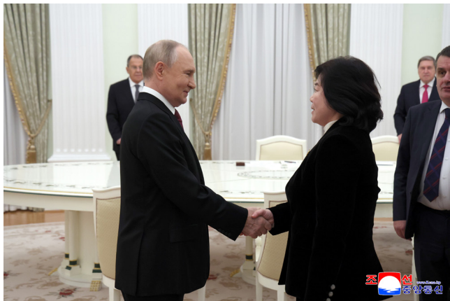
DPRK Foreign Minister Choe Son Hui meets Russian President Vladimir Vladimirovich Putin in the Kremlin of Moscow on October 27.